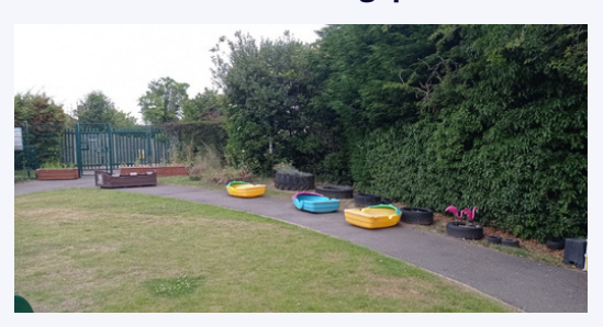
Sail away down our river pathway