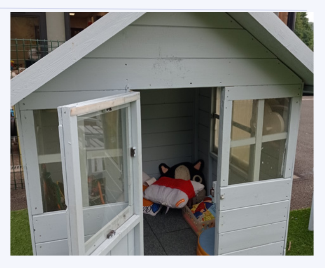
Our outdoor reading space

If your child has any additional needs that would prevent any of the above being achieved, please feel free to speak to us and we will ensure strategies are in place.